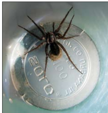
Female Pardosa sodalis with egg sac.

The most dominant spider species represented across the boreal FTT in the Yukon Territory is Pardosa lapponica (Thorell), which is a holarctic species that consistently comprises approximately 25% of trap captures. This species appears to be a tundra-adapted species but is found in lesser abundance in forested areas. Pardosa uintana Gertsch dominates forested